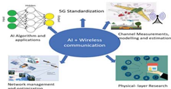
Fig. 1. A framework for AI technologies to B5G wireless networks [4].

There aren't many studies that look at the advantages of using AI in channel modelling, and the majority of extant works only use very basic AI approaches on a relatively small portion of the channel modelling process, with the exception of a recent study. The use of AI technology for channel measurements has not been thoroughly studied in any paper. Because of the high difficulty of simulating the signal transmission under a variety of conditions, traditional approaches use a lot of computation. The vast amount of measurement data currently available can be used to extract wireless channel properties, & with concurrent time, the medium modelling issue can be handled using data-driven approaches that easily integrate with model-based techniques. Computation precision-complexion trade-off& modelling methods will be kept in a fair balance.