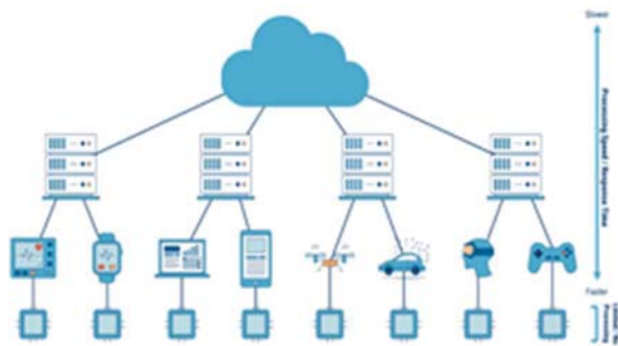
Fig. 4. Deep Learning Application in Different Computing Systems [20]

Though it is still in its early stages, the integration of Artificial Intelligence/Machine learning & communication system is moving forward quickly. Standardizing ML algorithms for B5G networks is incredibly challenging since the numerous transducers, systems, programs, & networks linked to this webis going to develop data in a wide range of forms & figures that must be communicated. There is no set baseline or standard ML algorithm, & uncertain to the entire transmission field that kind of ML programs work best for B5G networks.